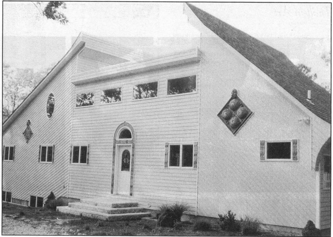
Fredi Cohen's "Archsculpt Studio" of East Hampton.

"I feel nurtured and happy when I take my shower in a work of art, or sit